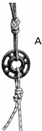
Figure 2. Single stationary: A single rope attached using a retraced figure-8 knot in a stationary rope setup.